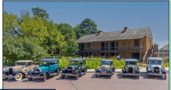
Mini-Tour to the Old Stone Fort