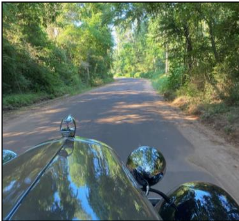
Grand Tour to Caddo Indian Mounds, Mission Tejas, and through the Davy Crockett National Forest