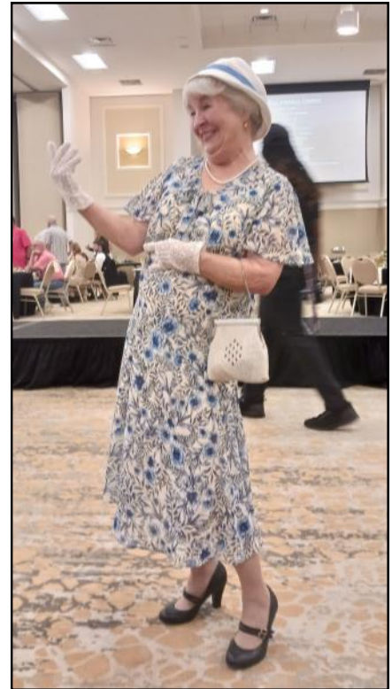
Fashion night for (some of us) at the awards banquet. With our special guest Bigfoot. But its alright. He's wearing shoes.