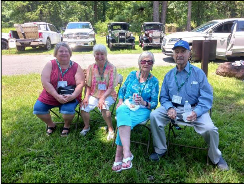
An outstanding Texas Tour! We had a fabulous time! Our small club group enjoyed a great catered lunch on the Grand Tour.