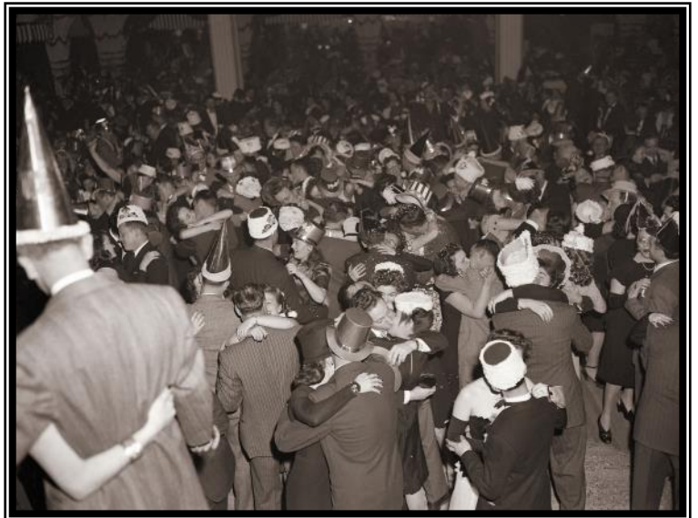
New Year's Eve at the Diamond Horse-shoe in New York, N.Y., on Dec. 31, 1941.

Not long after those German immigrants began setting a New Year's Eve example, another major influence