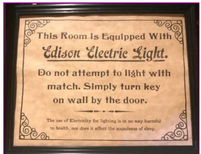
Interesting Historic Room Sign