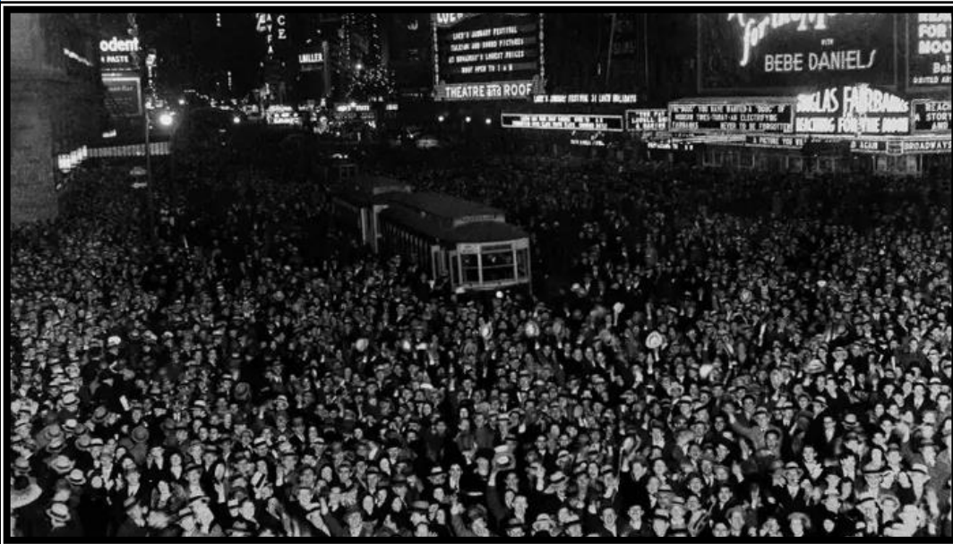
Times Square Dec. 31, 1930

The fact that there isn't a concrete origins story for New Year's Eve is certainly ammunition for people who think the push to find someone to kiss at midnight on New Year's Eve is overblown and overhyped. But for those who actually want to follow what's now a firmly settled tradition, its mysterious history seems unlikely to diminish its appeal, and in fact, enhances it.