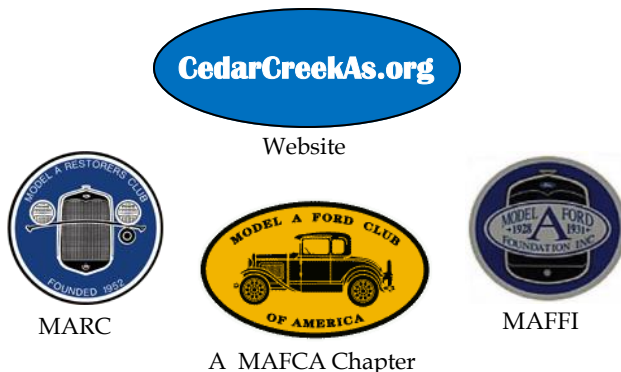
A MAFCA Chapter