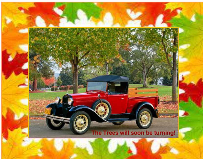
The Trees will soon be turning!