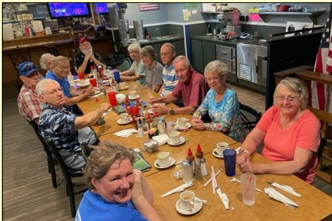
13 faithful CCMAFC members