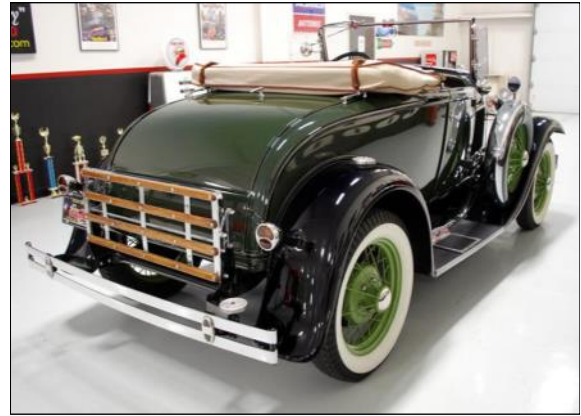
1931 Deluxe Roadster