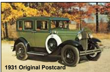
1931 Original Postcard

During the period of 1928 through 1931 there were approximately five million Model A's (all body styles) manufactured. The 1931 Model A Roadster was priced at $475.00 and weighed 2230 pounds - that's 22 cents a pound. There were 456,000 Roadsters produced by Ford during this four year period. Up to this point in history, convertible and roadsters had been far more prevalent. Soon, body style production would take a turn in the American market, with fixed roof and hardtop vehicles becoming more popular. For the Ford Model A, the most popular body style in 1931 was the Fordor sedan. Total 1931 Ford Model A production reached 541,615.