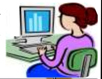
From the Editor