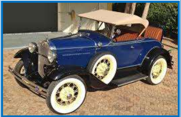
1930 Deluxe Roadster