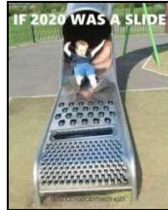
2021 will be a better year.

JAN 5, 2021 ..... Meeting at the DQ in Seven Points FEB 2, 2021 ..... Meeting at the DQ in Seven Points MAR 2, 2021 ..... Meeting at the DQ in Seven Points APR 6, 2021 ..... Meeting at the DQ in Seven Points APR 2021 ..... Spring Fling Tour (hosted by the Cheshires—more details later) MAY 4, 2021 ..... Meeting at the DQ in Seven Points JUN 1, 2021 ..... Meeting at the DQ in Seven Points JUN 3-6, 2021..... 58th Texas Tour in Kilgore hosted by Greater Houston MARC JUL 6, 2021 ..... Meeting at the DQ in Seven Points AUG 3, 2021 ..... Meeting at the DQ in Seven Points SEP 7, 2021 ..... Meeting at the DQ in Seven Points SEP 18, 2021 ..... International Model A Day OCT 5, 2021 ..... Meeting at the DQ in Seven Points OCT 22-24, 2021 ... Autumn Trails, Winnsboro, TX (Stew on Friday night) NOV 2, 2021 ..... Meeting at the DQ in Seven Points DEC 4, 2021 ..... Meeting Christmas Party