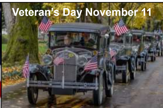
Veteran's Day November 11