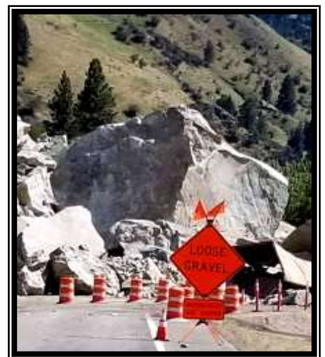
Answer to quiz on page 3 Dawn Gray Dark/Gunmetal Blue/Straw—28 Tudor

I've just found out they won't be making 12" rulers any longer