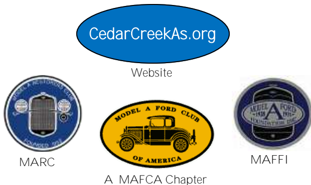
A MAFCA Chapter