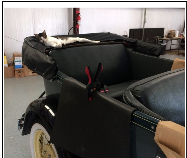
How to Mouse-Proof an 'A'