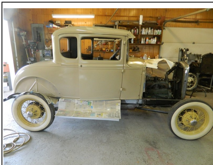
Looking good! Stone Brown.