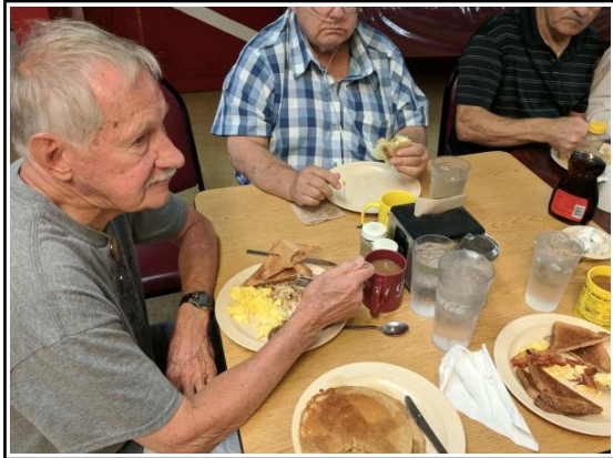
Proof that Walt doesn't ALWAYS get served last!