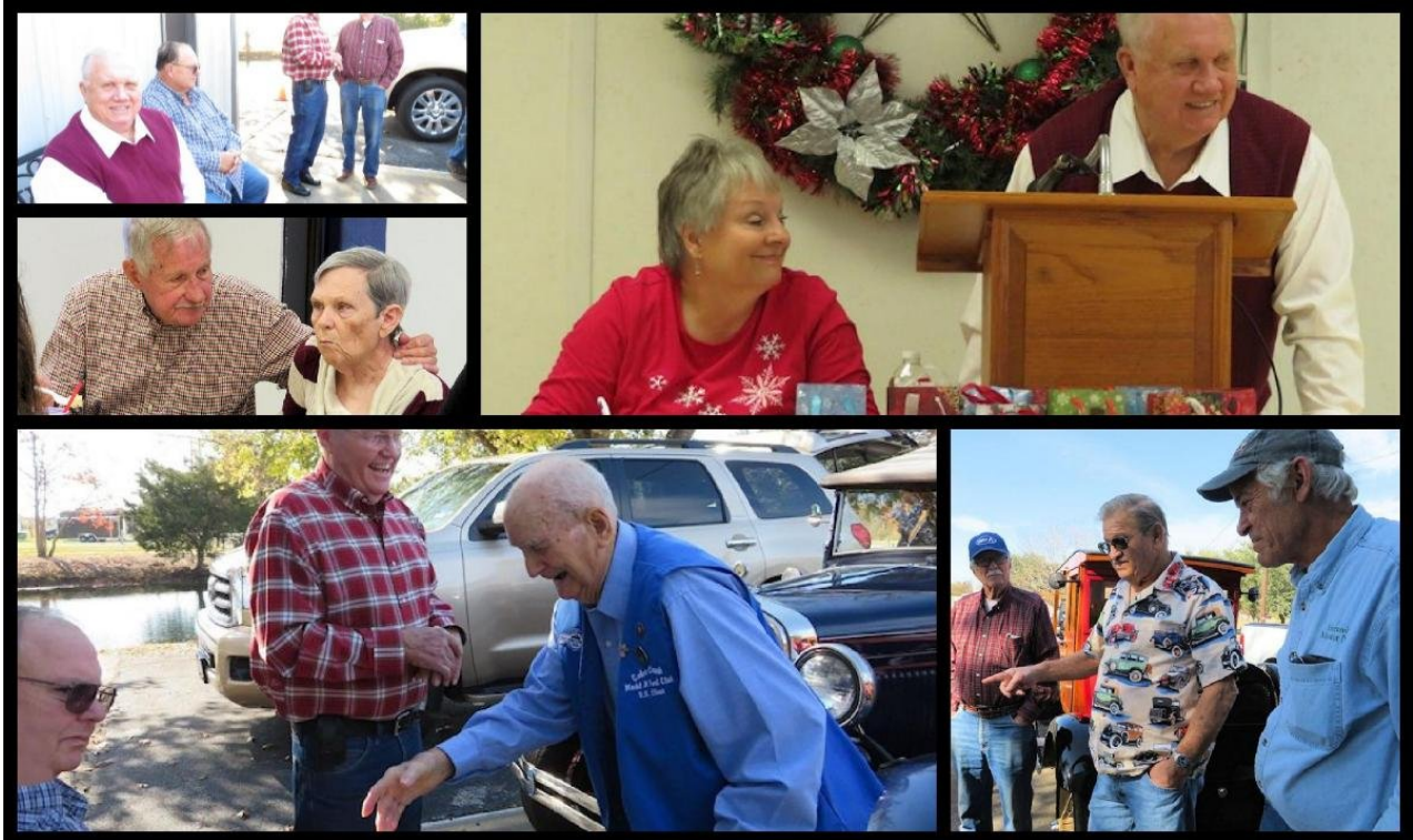
More Christmas

JUN 07-10, 2018 -- TEXAS Tour 2018. - 55th TEXAS tour. Back to the Hill Country. Fredericksburg, TX Host hotel is Sunday House Inn. 830-997-4484