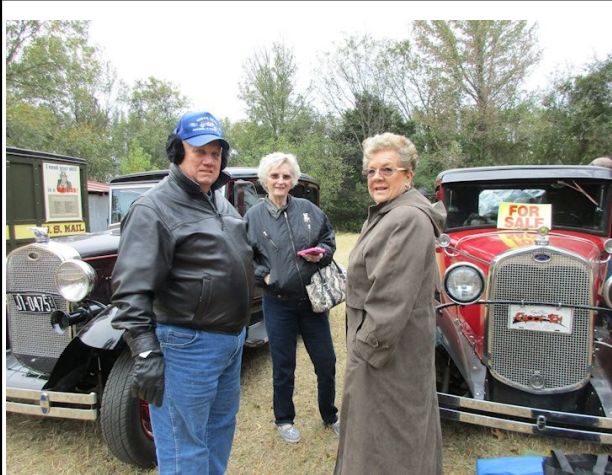
A cool evening for stew!