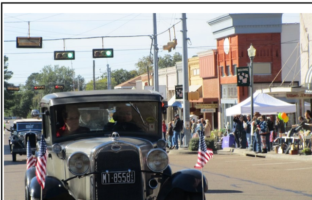
At the parade!